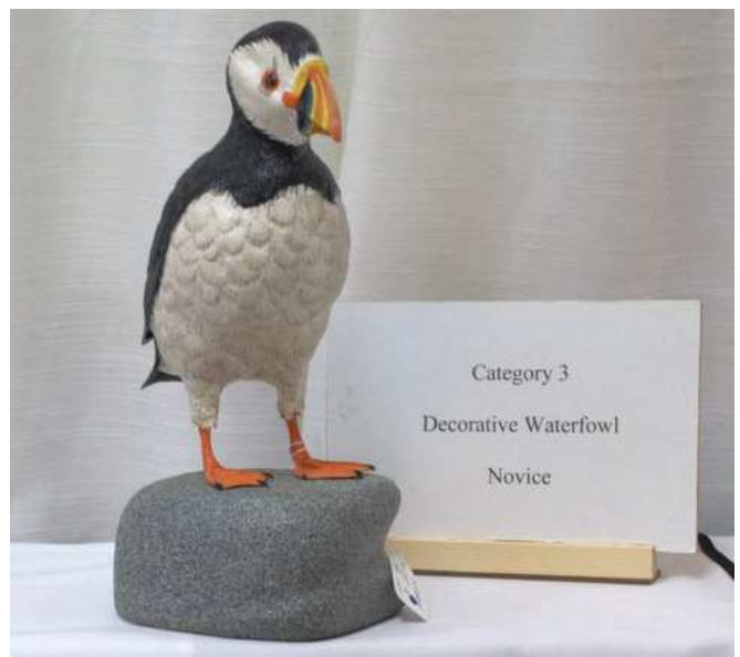
Allan Randall's carving of a Puffin earned him a 1 st place ribbon at the competition in Kitchener last month